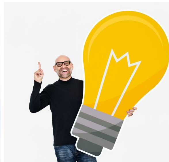
Illuminate new realities